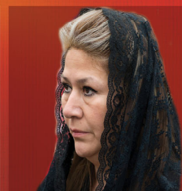
SPECJALNY GOŚC Z KOSTARYKI ŻYCIE ZAWDZIĘCZA ŚW. JANOWI PAWŁOWI II

REZERWACJE DO 15 MARCA 2015 W JOLLY INN ORAZ W POLONIJNYCH PARAFIACH WWW.JANPAWEL2.PL ILOŚĆ MIEJSC OGRANICZONA